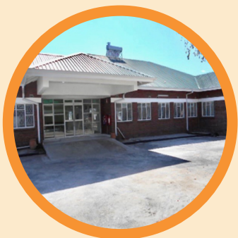
Danny Makuto Memorial Annex entrance to emergency rooms