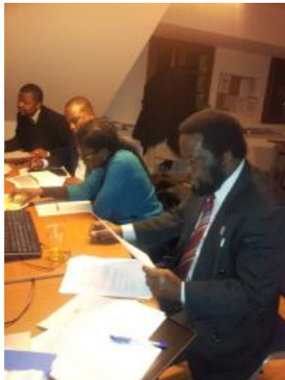
ZimHealth Executive Committee members and supporters at a planning meeting in Versoix

In 2012, the ZimHealth Executive Committee held monthly planning meetings in Versoix, in a meeting room offered at no charge by the GFMER. The Committee meets either on a weekday evening or a Saturday afternoon. Various sub-committees focusing on areas such as resources mobilisation, project management and liaison, publicity and procurement meet in between these monthly meetings for further planning of specific activities.