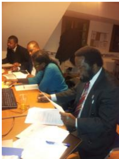
ZimHealth Executive Committee members and supporters at a planning meeting in Versoix

In 2012, the ZimHealth Executive Committee held monthly planning meetings in Versoix, in a meeting room offered at no charge by the GFMER. The Committee meets either on a weekday evening or a Saturday afternoon. Various sub-committees focusing on areas such as resources mobilisation, project management and liaison, publicity and procurement meet in between these monthly meetings for further planning of specific activities.