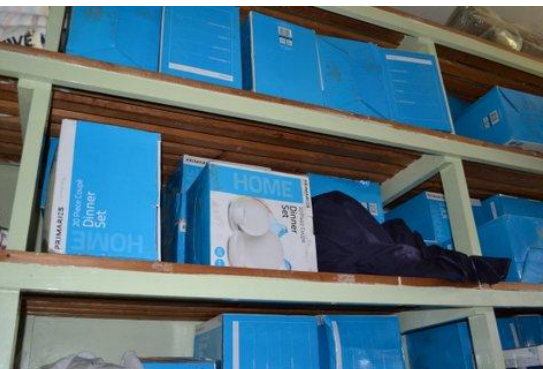
A glimpse of items donated to Thorngrove Infectious Disease Hospital in December 2010