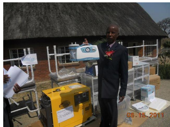
Handover ceremony and a sample of commodities delivered to Sakubva Polyclinic in 2011