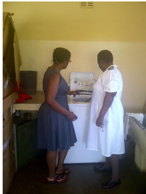
A sample of the items, washing machine and dryer, in use at a Masvingo clinic, January 2012