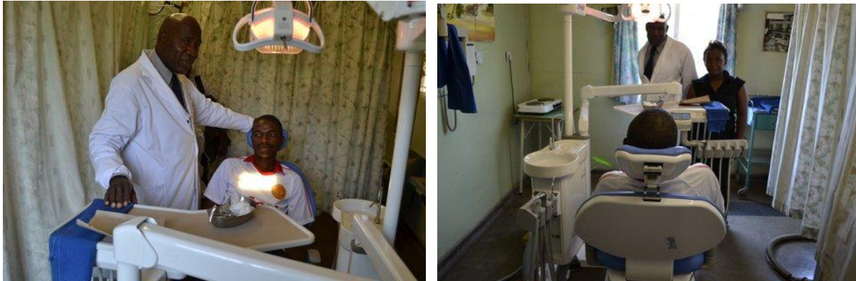
Dental chair in use with a patient (photo permission granted) being treated at Pelandaba, December 2011