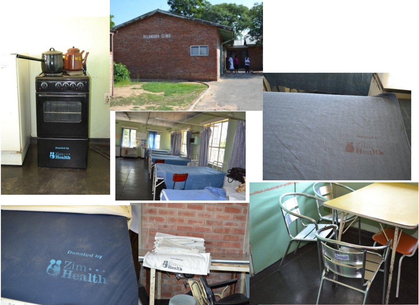
A variety of items donated by ZimHealth in use at Pelandaba Polyclinic during a visit made in December 2011