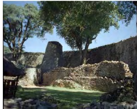
The Great Zimbabwe Monuments