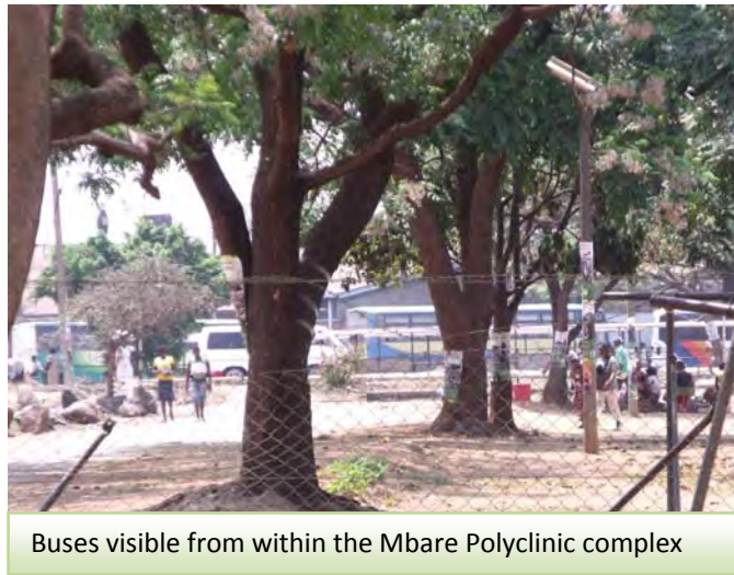
Buses visible from within the Mbare Polyclinic complex

Mbare Polyclinic is centrally located in one of the country’s highly populated residential suburbs. With a catchment population of approximately 135, 400 the polyclinic provides maternity services at its Edith Opperman Maternity Hospital and other primary health-care needs not only of its Mbare catchment area but also of people from other Harare suburbs and the rural areas. This is primarily because the complex is situated a short distance from the main bus terminus to rural areas and other parts of the city. The Edith Opperman Maternity Hospital is one of the country’s longest standing maternity homes in the country. Many Zimbabweans were born there and one can safely say that Edith Opperman has become a household name when it comes to maternity homes. With a bed capacity of 30 the clinic delivers an average of 350 babies per month.