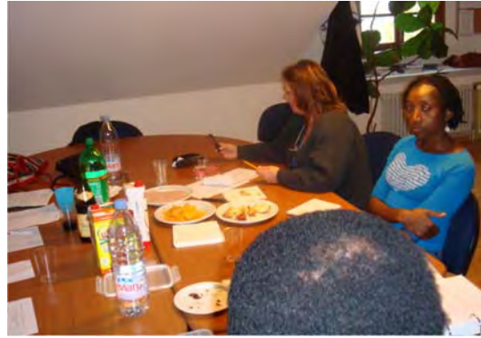
ZimHealth Executive Committee meeting in Versoix

enable members further away from Geneva to attend during the day time at times. Various sub-committees, such as the fundraising sub-committee, the procurement sub-committee, the publicity and entertainments sub-committee and the secretariat, have met in between these monthly meetings for further planning of specific activities and events, report writing and mobilising resources. The main