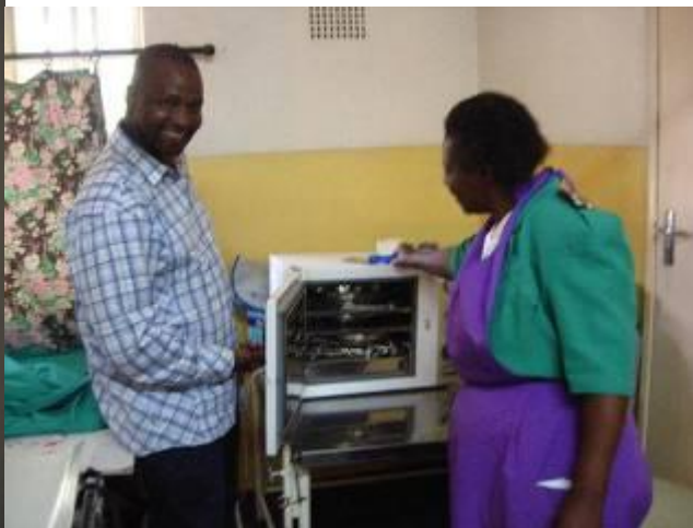
Resuscitaire, hot air steriliser and obstetric equipment donated by ZimHealth