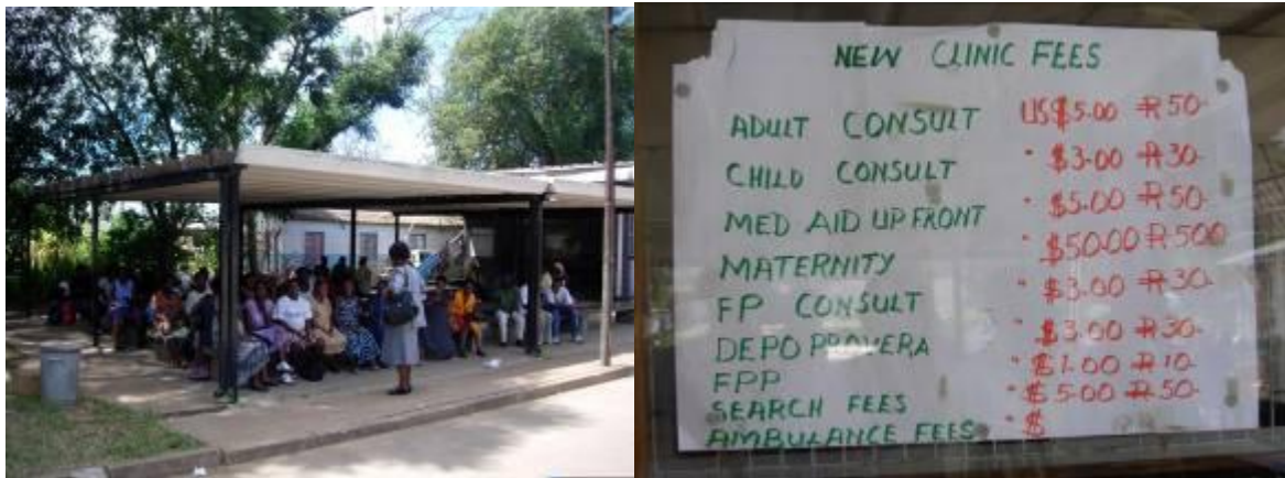
(left) Outpatients waiting area and (right) Notice of Fees (April 3rd 2010)

The Sister-in-Charge has discretion, at all times, to waive consultation and drugs fees.