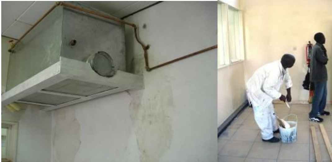
(left) Hot water geyser donated by ZimHealth and (right) Painters and Carpenters at work